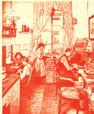
Kitchen of a home workers family, Berlin (1910)

Produced as a result of the artist's exhibition at the Centro Galego de Arte Contemporáneo (GCAC), Diagrams, 1994 – ongoing brings a survey of the diagrams created and exhibited by Ricardo Basbaum in recent years. In his own words, Basbaum takes the diagram as a "tool for intervention (...) a sort of drawing (or visual poem) that mediates the dynamic flow between words and images – discursive and non-discursive spaces – or literary and plastic spaces, etc.". Three essays by the artist are included here, followed by extensive documentation of the GCAC exhibition, and a large selection of his diagrams. The numerous contributions are assembled in the shape of a collective-conversation, where topics are discussed in relation to Ricardo Basbaum's work. Errant Bodies Press, Berlin errantbodies.org